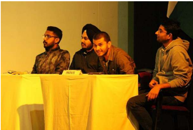
Teams participating with enthusiasm and gusto

After all, education is not just about going to school and getting a degree. It's about widening your knowledge and absorbing the truth about life.