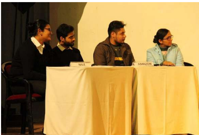
Teams listening to the Quiz Master with rapt attention