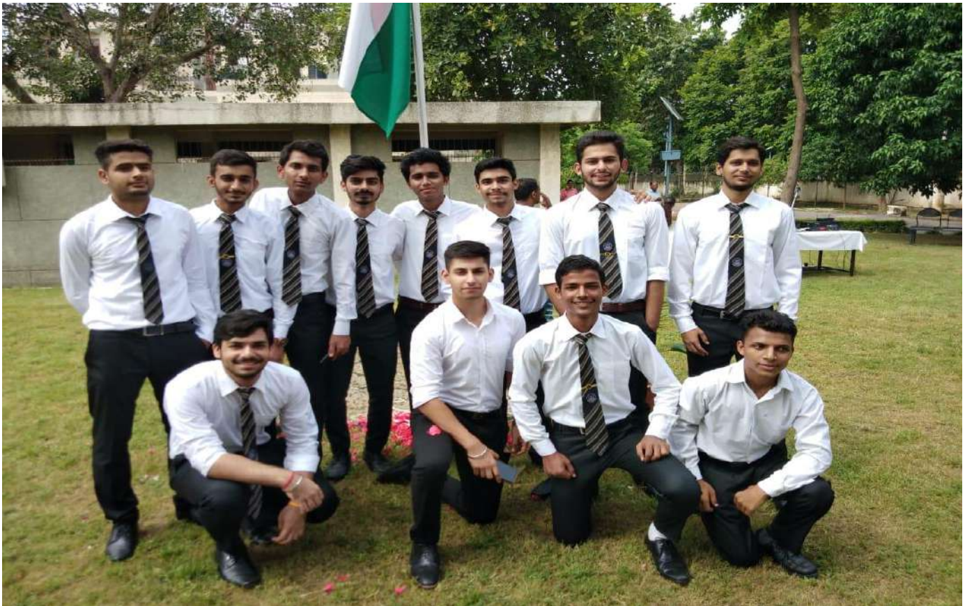
Beaming faces of students after the Flag Hoisting Ceremony