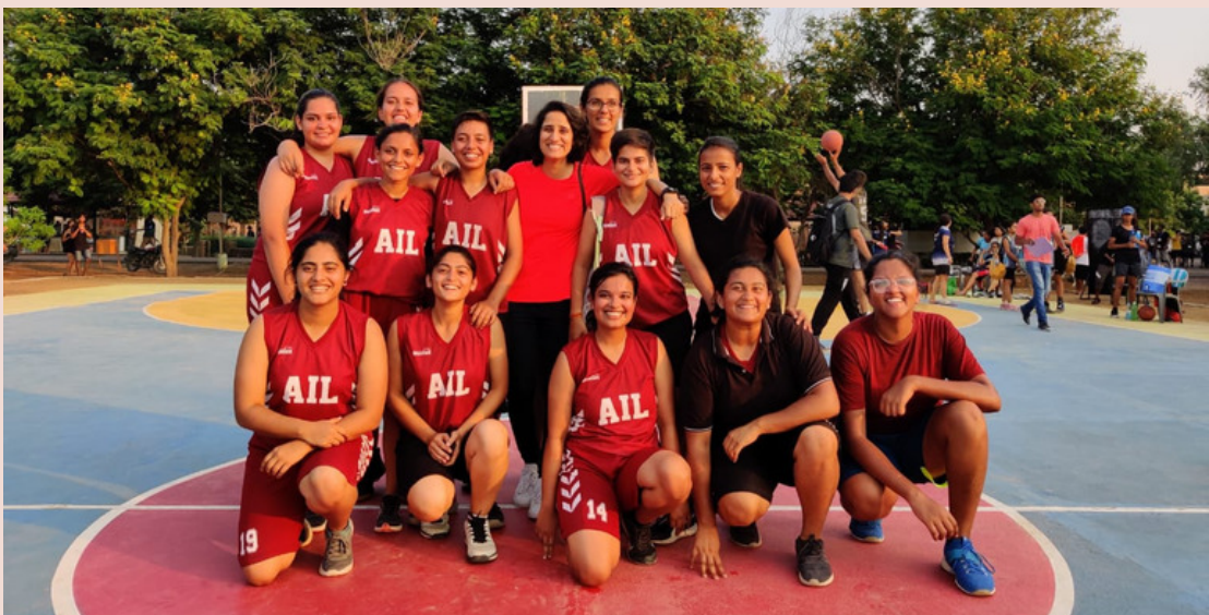
Girls' Basketball team zestfully participating in the highly competitive game while their faces radiate the confidence and happiness of brave hearts.