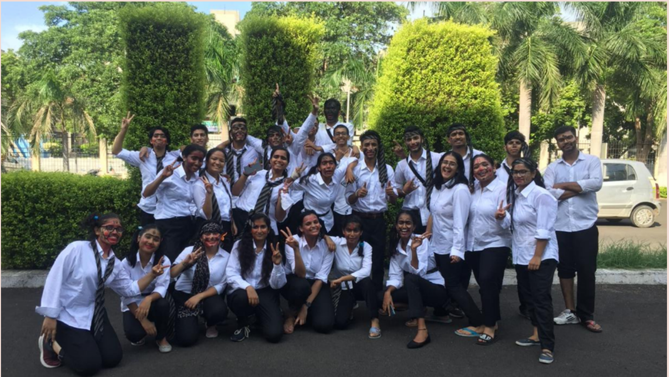
Ebullient students of the first year after Formal Introduction ceremony

It's a fresh year, filled with new vigour and the fresh young minds have entered the portals of a new world called Army Institute of Law. Other than the conventional method of welcoming the freshers with a fresher's party, AIL also has its peculiar way. Before the fresher's party comes the Formal Introduction and the Escort ceremony. The 9th day of August was rhapsodic as the students of the 1st year were to give their formal introduction before the college which included their seniors and the faculty members. The zealous students were dressed up by their 2nd year seniors in quite a quirky way. There was an echo of slogans and giggles as the enthusiastic students marched up to the MP Hall.