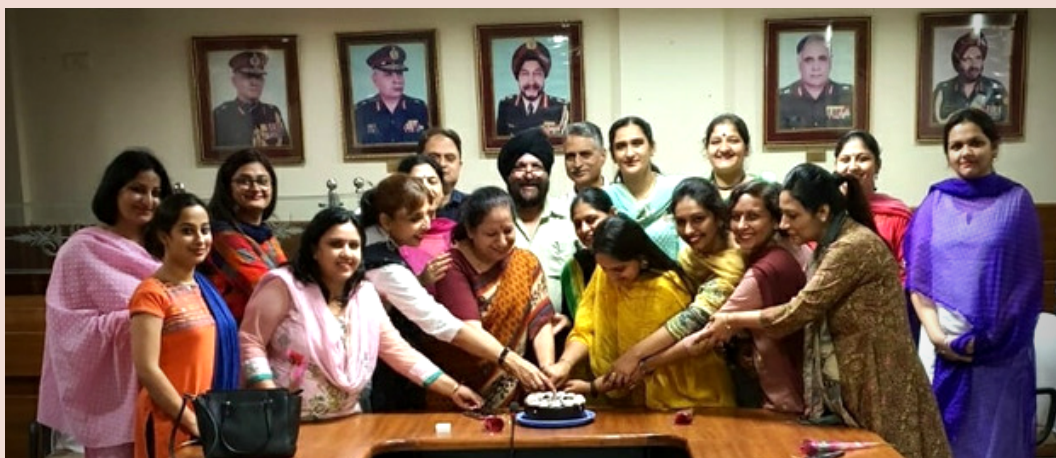
Teacher's Day being celebrated at AIL

Einstein once said, "it is the supreme art of a teacher to awaken joy in creative expression and knowledge."