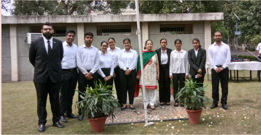
Beaming faces of students after the flag-hoisting ceremony

It was a red letter day in the history of India when the country got her freedom on August 15, 1947. It took hundreds of years for us to break shackles of slavery. People of the country celebrate this festival every year with great pomp and show. The main Programme is celebrated at the Red Fort in New Delhi. Besides, this festival is also celebrated in every city and town, in school, college and university. Army Institute of Law, Mohali celebrated this auspicious day with utmost enthusiasm and patriotism.