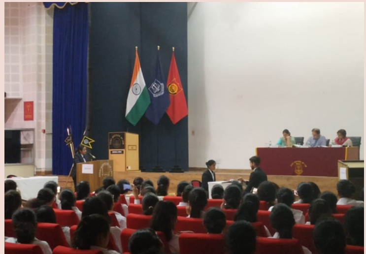
Demo Moot Court proceedings