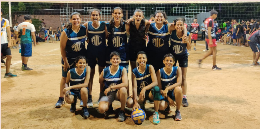
Girls' Volleyball team in Yuvadha Fest

The event was organised from 26th-29th September in the league format. The students of AIL bagged medals in athletics well as team games with a medal tally of 4 gold, 4 silver and 4 bronze as well with brilliant performance in cricket, basketball and football. Such events provide a not only a balanced life to an academic student, but also help him to gain a holistic development of his personality to face the world in the long term by developing ethos regarding team-work. Events like Yuvadha Sports Fest provide the students a fair platform to showcase their capability by adding more feathers in the cap of this great institution.