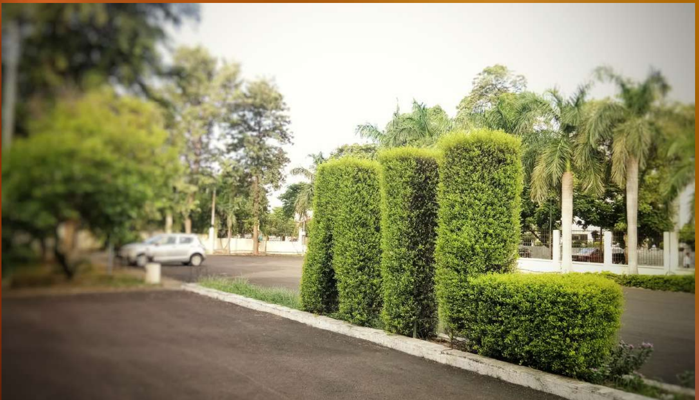
Lush Green Campus of Army Institute of Law, Mohali

The teams took up the initiative of picking up litter and disposing it, thus cleaning the footpaths and the general residential area near the college, which also included a community temple. The volunteers were rewarded for the two hours of hard work put in by them, in the form of refreshments upon returning. All in all, the earnest participation of the students reflected the success of the cleanliness drive and lived up to the expectations attached to this initiative.